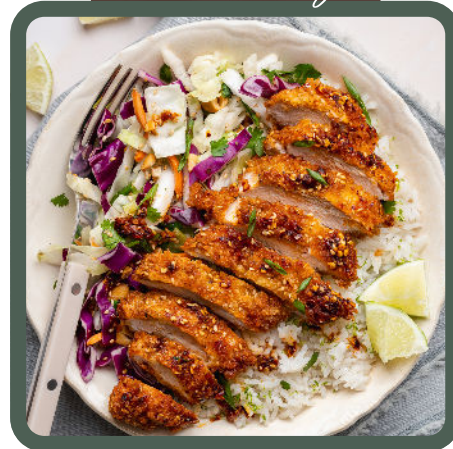
Sesame Chicken Coconut Rice Bowls