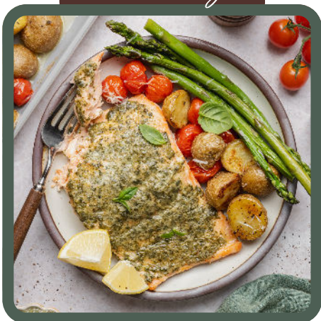
Sheet Pan Pesto Salmon