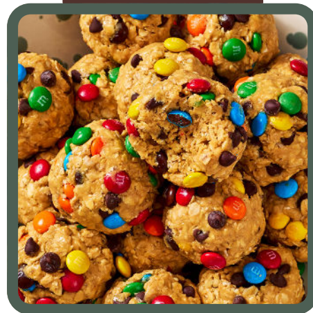
Monster Cookie Protein Energy Bites