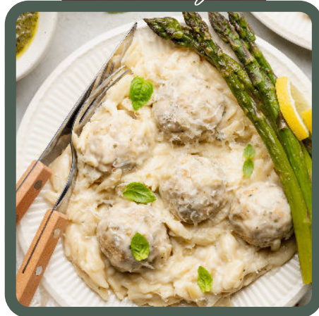
Pesto Chicken Meatballs & Orzo