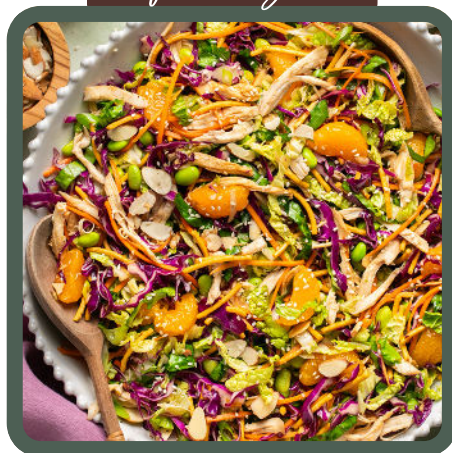
Chopped Sesame Chicken Salad