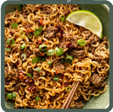
Chili Crisp Beef Ramen Noodles